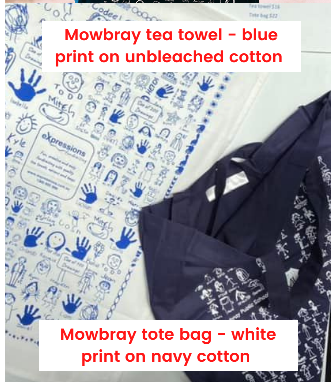
Mowbray tote bag - white print on navy cotton