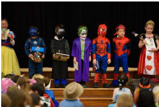
Fun for Students and .....

Book Character Parade – To celebrate Book Week, on Thursday in Week 5 we will be having a Book Character Parade. It is very exciting that we will be able to hold a parade this year. K-6 students (and teachers!) love getting involved and dressing up as their favourite book character. Students are encouraged to be creative and use materials and resources found in the home.