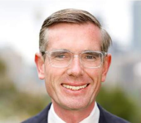
Dominic Perrottet MP Premier of New South Wales