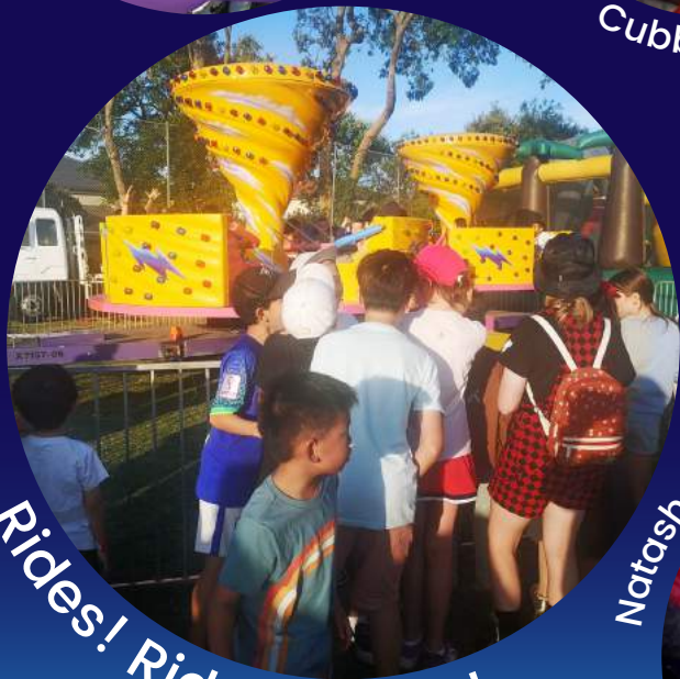
Rides! Rides! Rides!