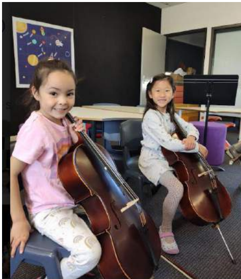
Weekend of Music