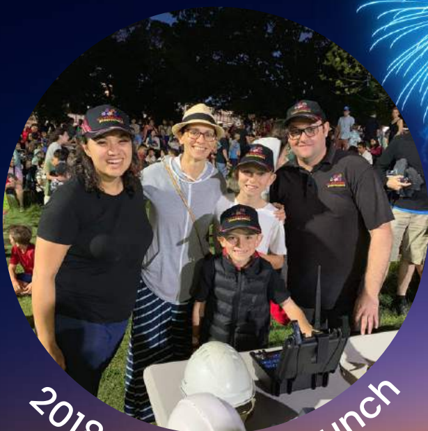
2018 Fireworks launch

BID ONLINE: www.32auctions.com/CelebrateMowbray2022