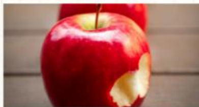
HAPPY WORLD TEACHERS DAY Friday 18 October 2019