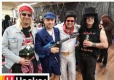
LJ Hooker Lane Cove